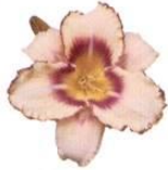
Man's Best Friend

When I say gardening in 3D, I am sure your mind jumps to height, width and things jumping out at you, like on a movie screen but in this example, it's not the case. Instead I wanted to talk about something interesting that I have noticed, not only in my gardening life but in many of the gardens that we visit during conventions. What my three "D"s stand for are this: Daylilies, Dogs and as an added touch, Dandelions.