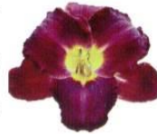
Damian Carlton Jewell

am sure they were just as excited about my new daylilies when I brought them home, or it could have just been the smell of other dogs. My hybridizing program was fairly new when the unthinkable happened, like a daylily bloom, it seems that our lives with our companions are far too short. In February, after over 15 years together, Damian passed away followed by Lucy three months later. My only recourse to keep them alive was memorializing my closest friends. Three plants were selected and thus, three introductions: "Man's Best Friend", "Damian Carlton Jewell" and "Sweet Puppy Kisses," and after several years wait, Lucy's plant will be introduced in 2014. I dedicated a small corner of my garden to them, a quiet shady spot with a plaque and a Celtic cross.