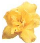
Sweet Puppy Kisses